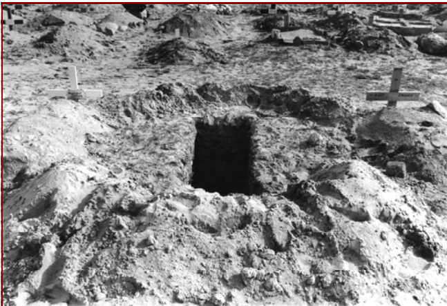
Burial Plot, Nyanga Cemetery