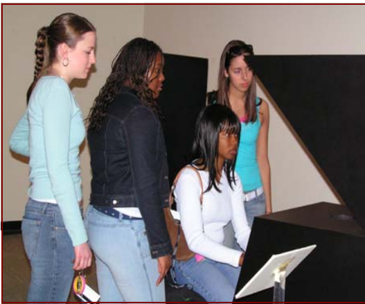
Students take part in Nancy Burson's interactive art, the Human Race Machine.

The Benton Museum is looking to cooperate with the different human rights institutes on campus. The Museum wants to add a significant layer to what the institutes are doing to participate in the education and creation of humanistic students. "I think that there are a lot of meaningful lessons and ongoing discussions that all of the institutes are providing, and I am just really seeing the Human Rights Gallery as the greatest opportunity that the art museum has," said Scalora.