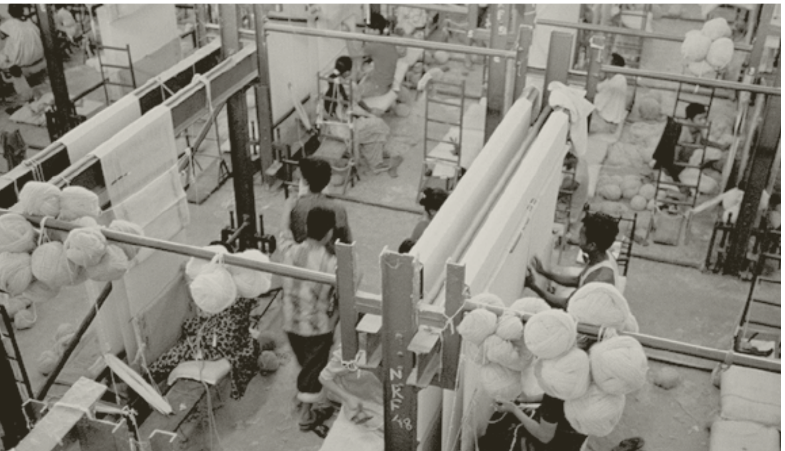
RugMark-Inspected Factory

This final section also explores policy options for financing human rights promotion, such as a global financial transaction tax, and options for democratizing the corporate form.