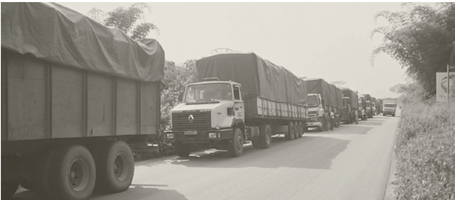
Trucks Halted At Roadblock As Truckers Declare Strike

practices. Given these factors, emphasis needs to be placed on confidentiality, where interviews with workers are conducted off-site to minimize possible retaliation.